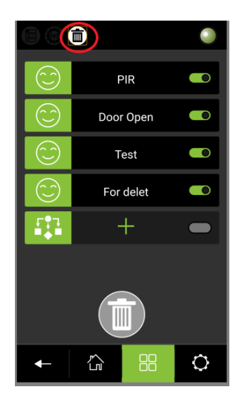
Step 3. Choose and hold the setting that you want to delete then drag to trash can.